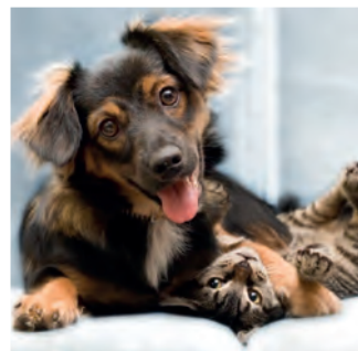
Safe for all your Family