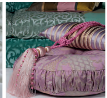
Perfect for Fine Silks

FOR MORE INFORMATION, VISIT: www.microsealcharlotte.com or CALL 704-660-5410